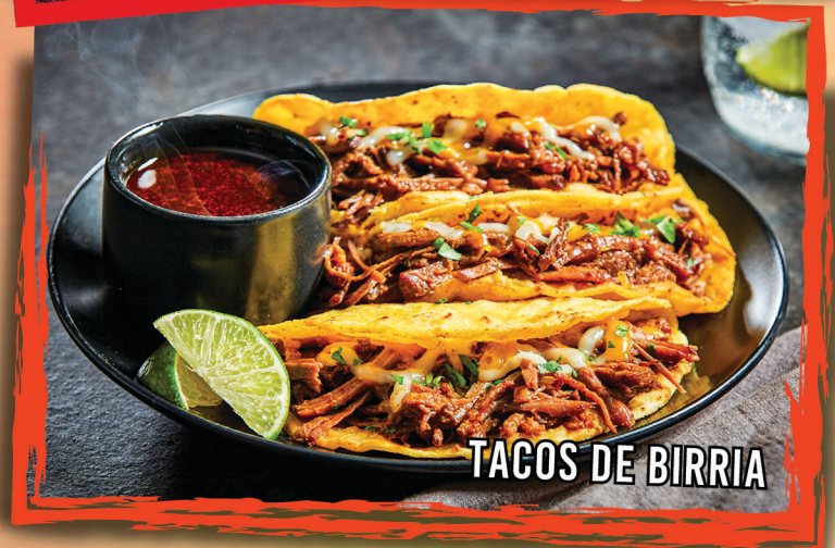
TACOS DE BIRRIA