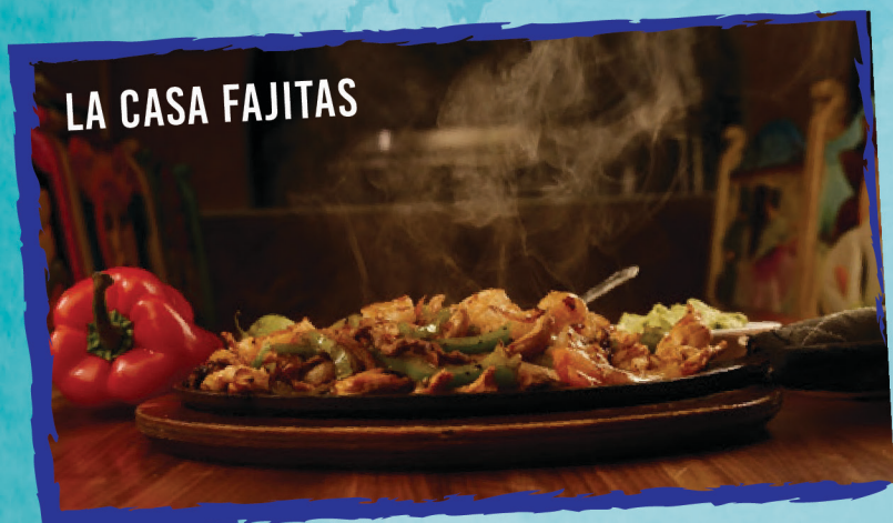
LA CASA FAJITAS

Two juicy grilled chicken skewers drizzled with chipotle sauce resting on a bed of rice. Served with delicious blend of grilled veggies. 15.99