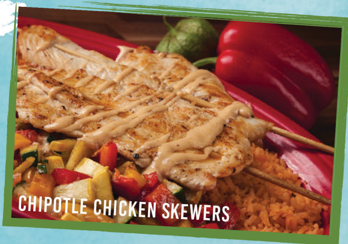
CHIPOTLE CHICKEN SKEWERS

Topped with ranchero sauce and melted cheese. 23.25