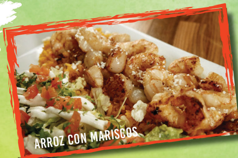
ARROZ CON MARISCOS

Tilapia grilled with bell peppers, onions, squash and zucchini. Served with sour cream, radishes and white rice. 16.99