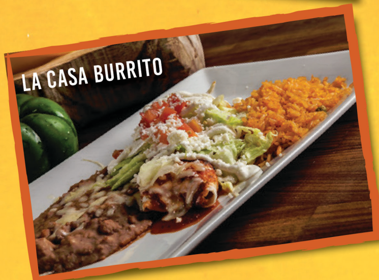
LA CASA BURRITO