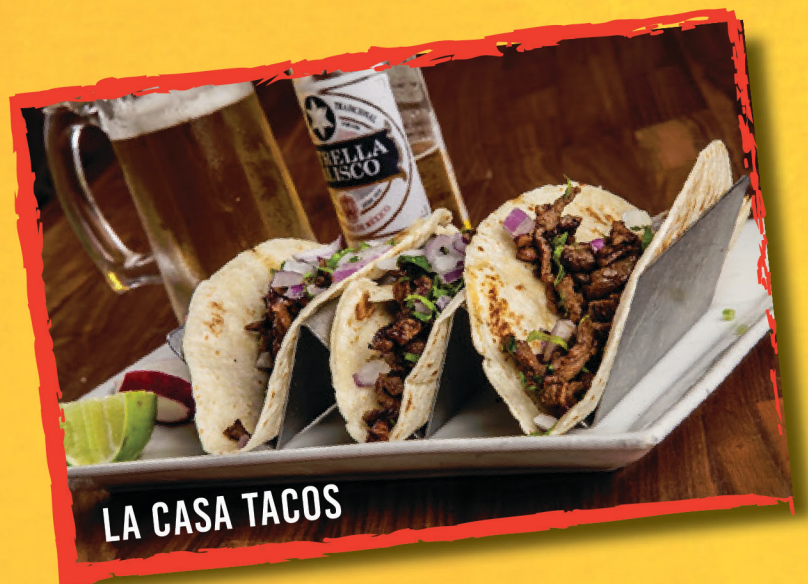
LA CASA TACOS