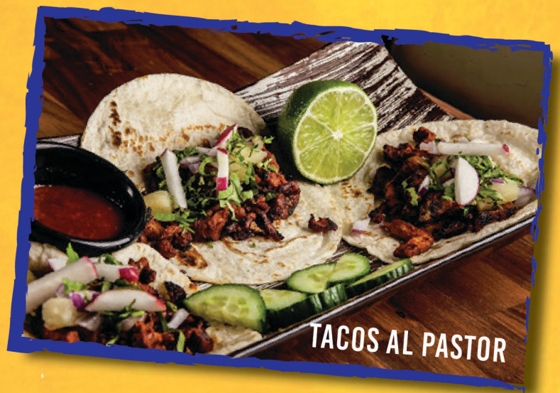
TACOS AL PASTOR

Three crunchy or soft tacos, stuffed with your choice grilled chicken or steak, lettuce, pico de gallo, our chipotle sauce and sprinkled with queso fresco. 13.25