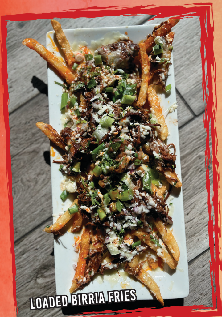
LOADED BIRRIA FRIES

Cheese nachos served with our famous juicy Birria cheese sauce green onions chopped cilantro and queso fresco. 15.50